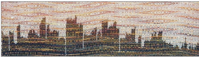
Bright Lights Big City (detail) by Rachel Toporowski, 2018 Climate Change Competition

Festival of Quilts June 1 (10-5) & June 2 (10-4) at Central Lions Seniors Centre, 11113 - 113 St. Edmonton AB. Admission: $10 (Children < 12 free)